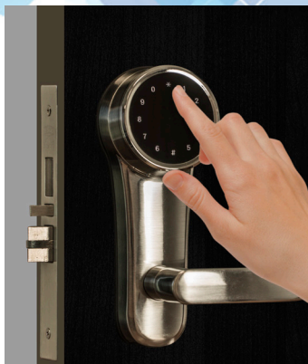
Multi-function, touch activated smart keypad and reader.