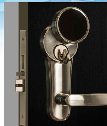
Swivelling keypad reveals concealed mechanical key access override.