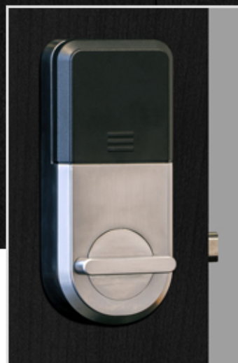
Inside latch & battery compartment