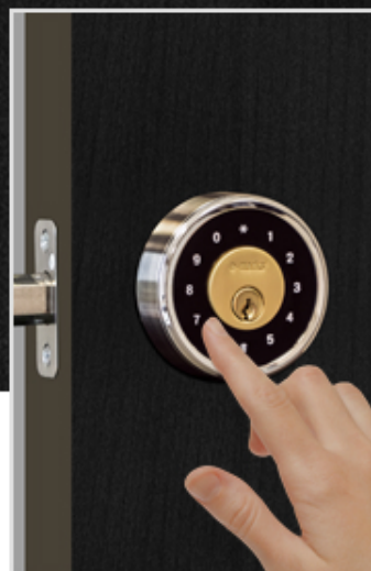
Touch activated PIN pad screen