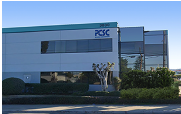
Corporate Headquarters in Torrance, California

PCSC is a designer and manufacturer of quality access control solutions. From integrated hardware to sophisticated access control management software, including: video badging, CCTV control, elevator control, alarm graphics, and video event recording. With a full-line of wired and wireless intelligent controllers, Fault Tolerant systems and multiple card reader technologies to choose from.