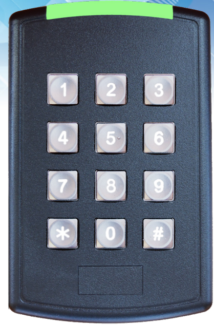
ET25 Keypad Reader