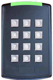
ET25 Keypad Reader