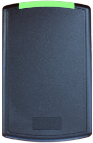
ET20 Single Gang Reader