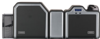
Lamination option and dual-sided printer/encoder