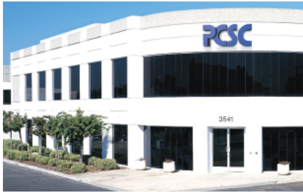
Corporate Headquarters in Torrance, California

PCSC is a designer and manufacturer of quality access control solutions. From integrated hardware to sophisticated access control management software, including: video badging, CCTV control, elevator control, alarm graphics, and video event recording. With a full-line of wired and wireless intelligent controllers, Fault Tolerant systems and multiple card reader technologies to choose from.