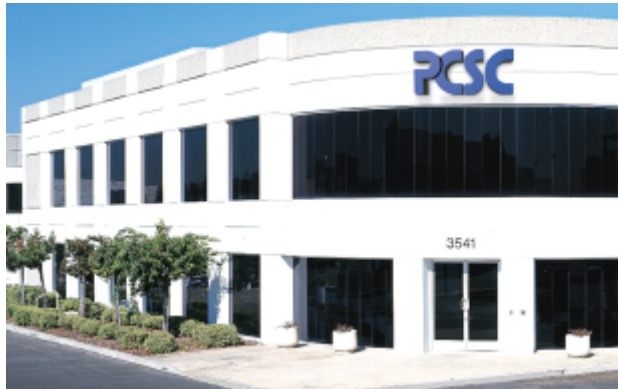
Corporate Headquarters in Torrance, California

PCSC is a designer and manufacturer of quality access control solutions. From integrated hardware to sophisticated access control management software, including: video badging, CCTV control, elevator control, alarm graphics, and video event recording. With a full-line of wired and wireless intelligent controllers, Fault Tolerant systems and multiple card reader technologies to choose from.